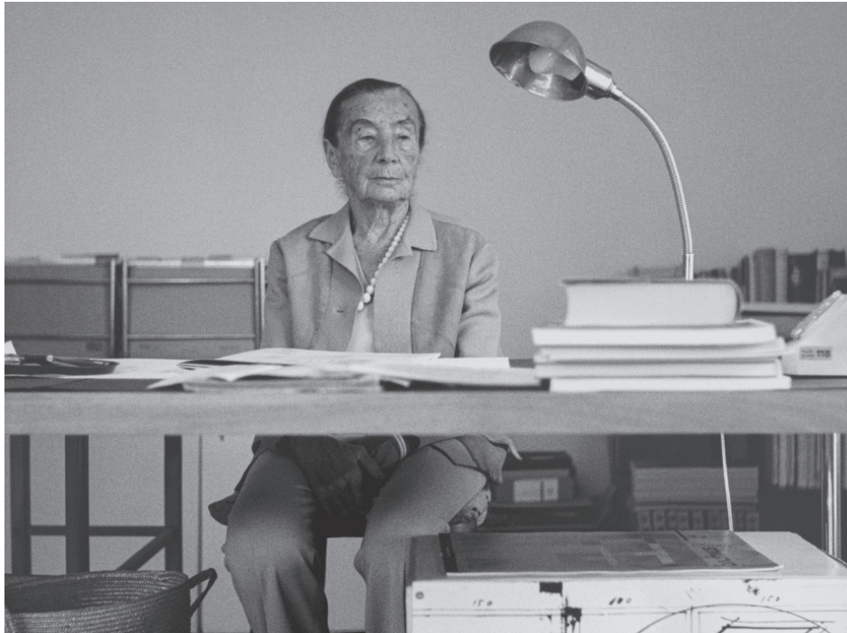
Giorgio Hoch, Untitled (Lucia Moholy), c. 1980.