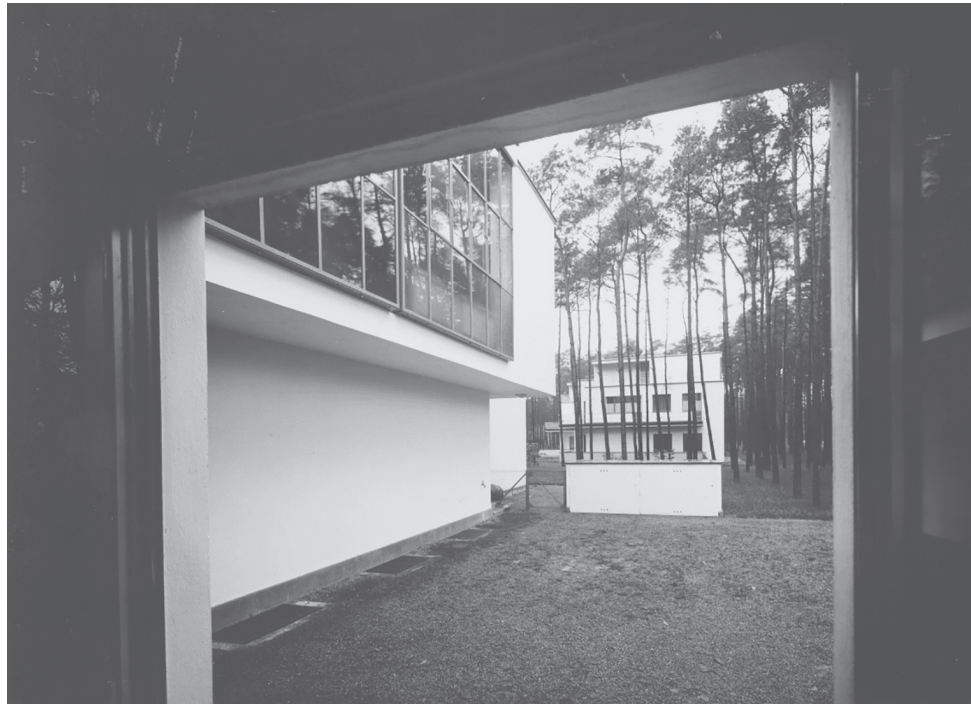
Lucia Moholy, The view from Lucia Moholy's window, Dessau, 1926. Fotostiftung Schweiz, Winterthur. Copyright: Lucia Moholy © OOA-S 2024 / Fotostiftung Schweiz, Winterthur.