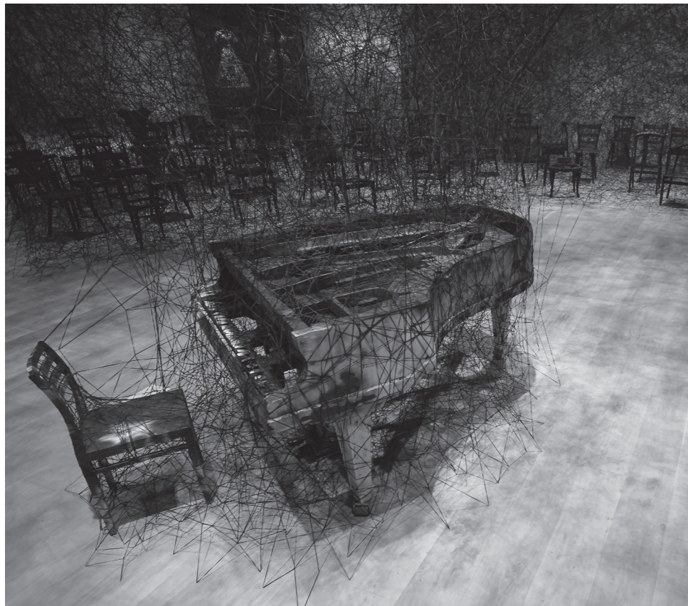
In Silence , 2002/2019 installation view Shiota Chiharu: The Soul Trembles , Mori Art Museum, Tokyo, 2019 (courtesy of Kenji Taki Gallery), photo: Sunhi Mang; photo courtesy: Mori Art Museum, Tokyo; © OOAS, Praha, 2024 and the artist